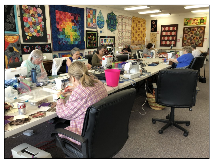
Diligent sewists from the June 4, 2023 Cheat Retreat

Opening and closing times depend on retreaters' eagerness and endurance. Retreaters can share snacks, bring their own, or go out. Cost is $25 a day. Come for one or both days! We provide ironing and cutting stations. Spots are limited, so sign up ASAP to reserve yours! Pay at the Museum, at a Guild meeting, or online at <u>www.whitebluffsquiltmuseum.org</u>