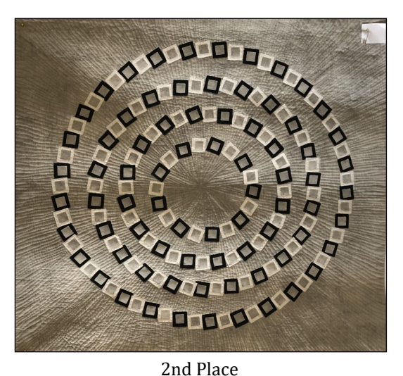
Aicha Bourouh - Going in Circles