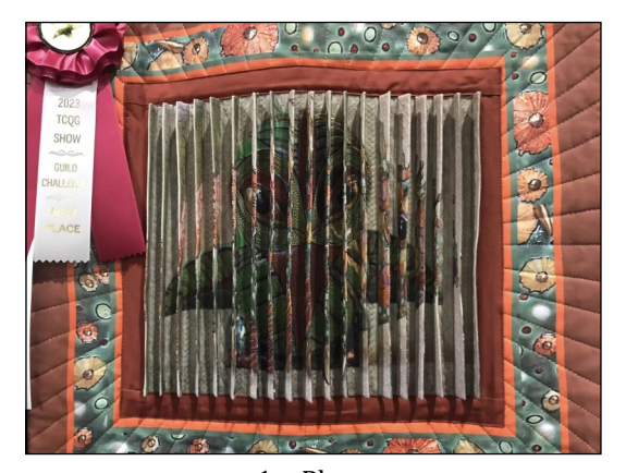
1st Place Louise Peterson - Pick a View