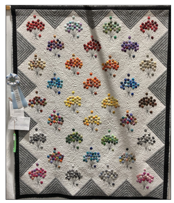
4th Place Elaine Brouillard Balloon Bouquet